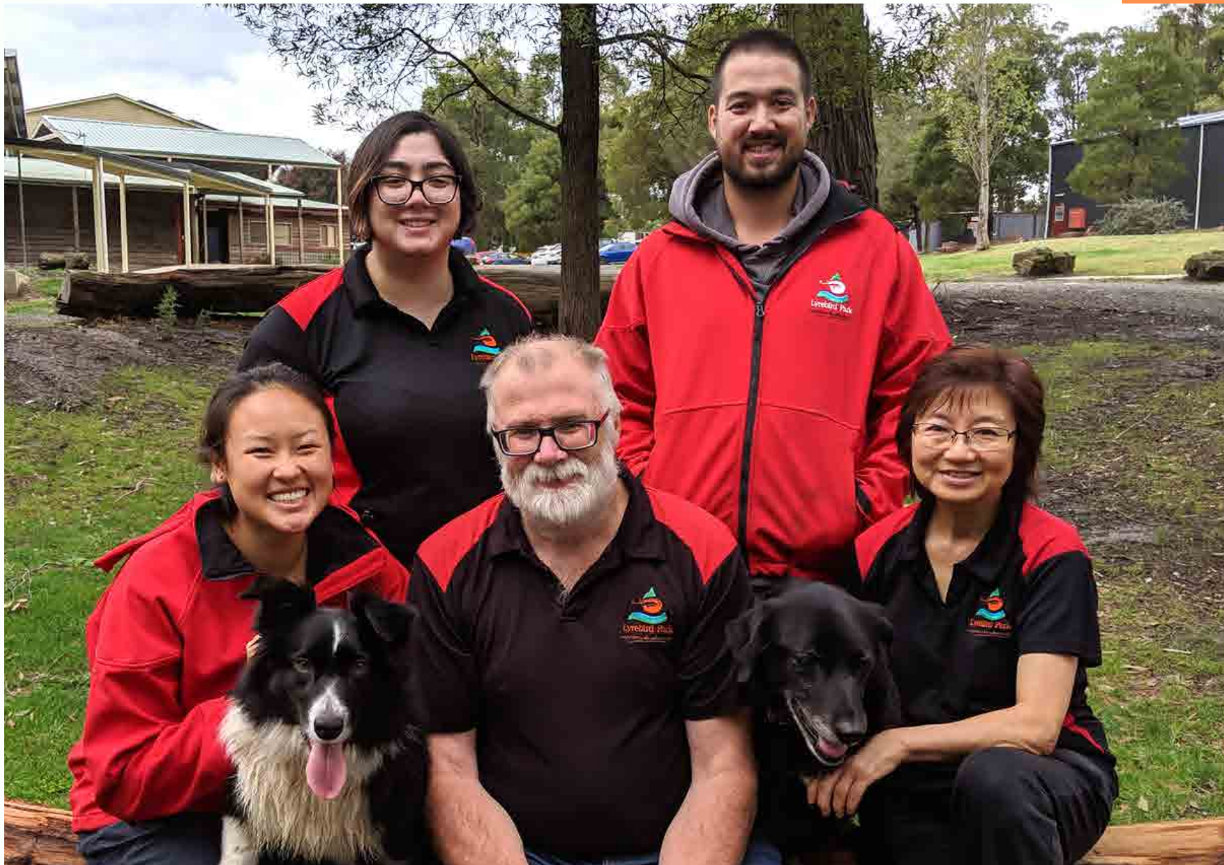
The Williams Family

Lyrebird Park Camp is located in Yellingbo in the Yarra Ranges Valley, on 52 acres of beautiful and breathtaking undulating natural bushland, all just one hour's drive South east from Melbourne's CBD.