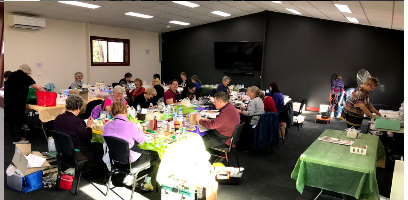
EXAMPLES OF ROOM USAGE